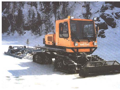
Check out the new Tucker! Do you think you have what it takes to operate this??