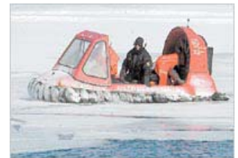
A rescue team searching for a snowmobiler that thought it would be a thrill to try skimming.

We would like to ask everyone to think before attempting to skim open water. To discourage friends and loved